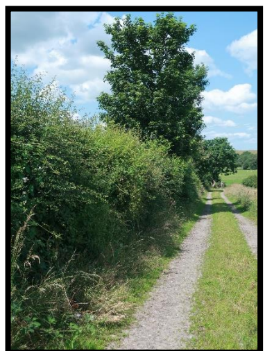
A wild hedgerow on our farm. Leaving it wild like this creates perfect habitats for important wildlife.

Protecting our local species is important and we're determined to do our part!