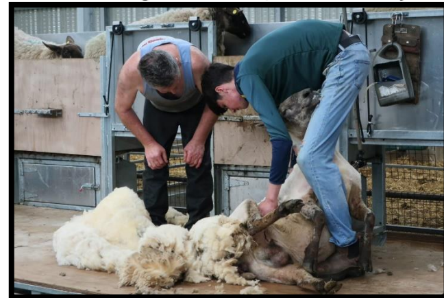
Time for sheep shearing, and a great teaching opportunity for those students interested.