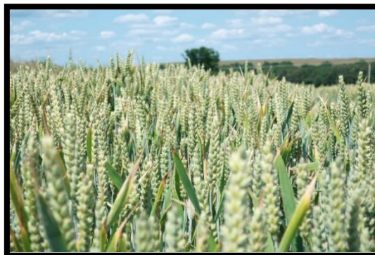
Our crops are starting to turn- it's time to look forward to the harvest period.

Gurteen College has a vast and wonderful history. What not a lot of people know though, is that Gurteen was the first college in Ireland to allow female students to attend right from the day we opened! It's something we're incredibly proud of!