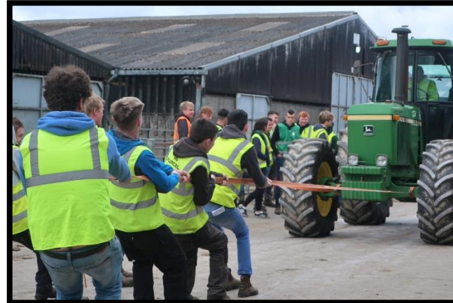
Students doing a Tractor Pull, in aid of Charity.