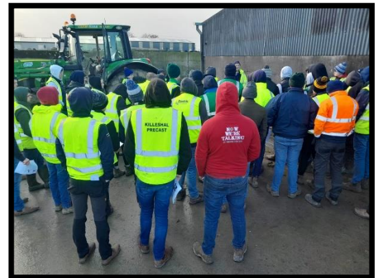
Level 5 students completing a safety session on slurry handling ahead of their placements.

The full-time courses on offer at Level 6 are Dairy Herd Management, Drystock Herd Management and Crops and Machinery Management. The three groups have all departed for a 16-week placement on a host farm sources by our college placement officer. This year we have 12 students who have requested to do their placement abroad. Students are travelling to Wales, Scotland, England, Germany and New Zealand.