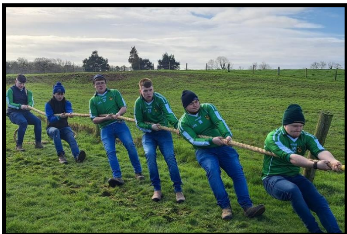
Our Tug-O-War team pulling hard, and eventually winning the bronze medal!