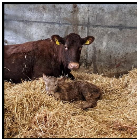
One of our suckler cows with her new-born calf.