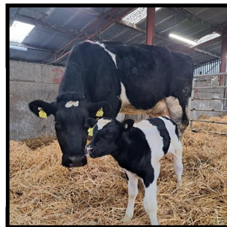
New-born dairy calves from our pedigree Holstein Friesian herd