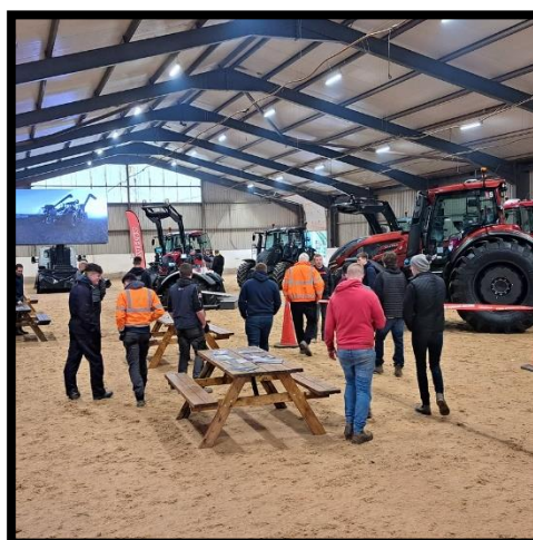
Valtra showing off their new models in the Q series

It's always great to have companies like Valtra onsite for events like this, allowing our students a chance to see some of the best upcoming farming machinery first-hand!