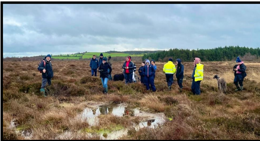
Our Agricultural Science and Sustainability degree students at Schoaboy Bog in Cloughjordan

Level 6 Students completing their Moylussa Mountain Climb in aid of Charity.