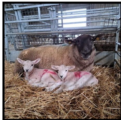
Twin lambs born in January.