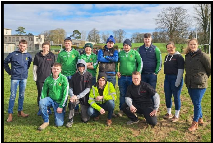
The Gurteen College team at the Macra na Feirme Inter-Colleges Day at Salesian Agricultural College.