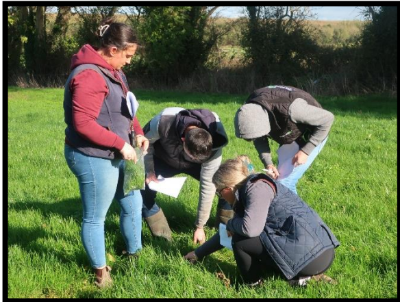
Level 6 Students completing one of their weekly grass walks, where they monitor the quantity of grass in our paddocks.