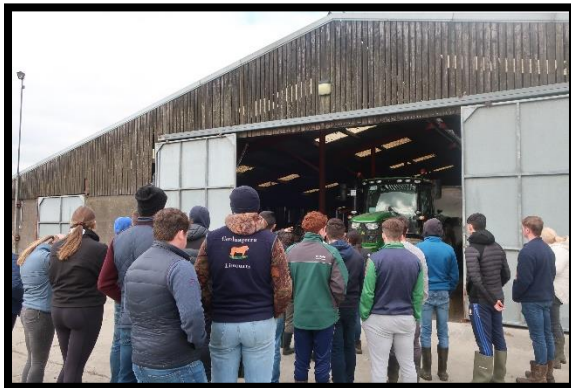
First Year degree students on a tour of the Gurteen farm in preparation of their Semester here after Christmas.