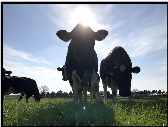
Unfortunate news regarding our annual bTB test, but we stay optimistic for the future.