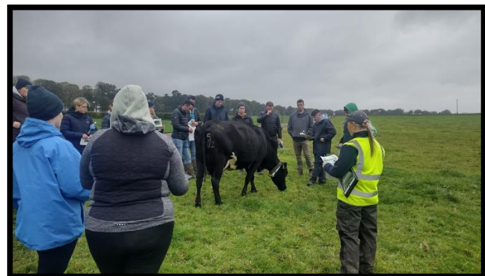
Third Year degree students at Moorepark research centre as part of their module on Grassland Management and nutrient management planning.