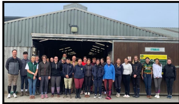
The equine classes of 24/25- it's great to see this course grow and grow!