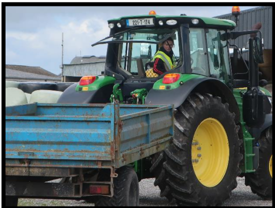
Level 5 Agriculture students practicing their tractor driving skills in our yard.