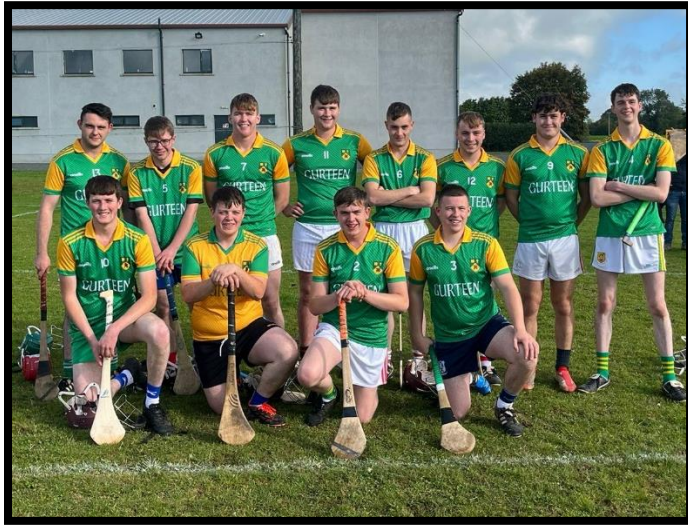
Men's Hurling team for 2024/25