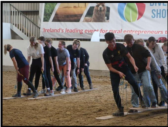
Equine students completing some ice-breaker games at the start of term