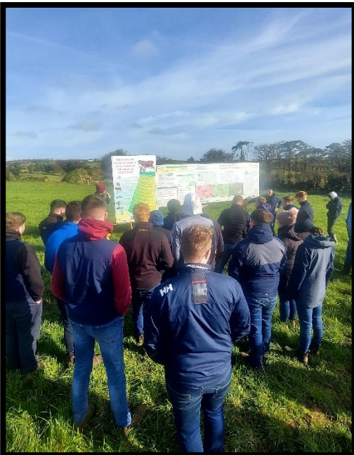
Level 6 Drystock students attending the Newford suckler demonstration farm open day.

Want more frequent updates? Follow us on all our social media pages!