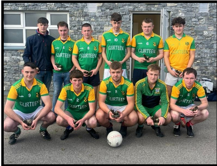
Our shield winning men's 7 aside football team!