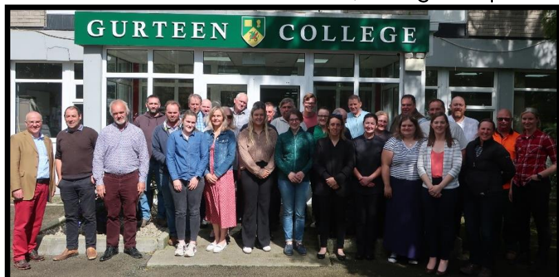
Gurteen staff photo for 2024.