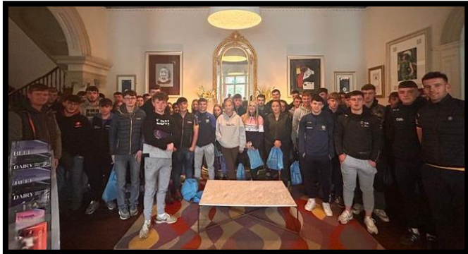
At the start of term, the second-year degree students took fascinating a trip out to Dovea Genetics.