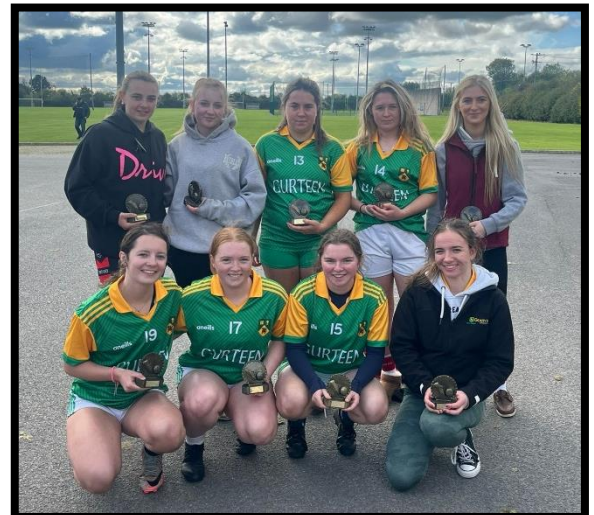
Our shield winning women's 7 aside football team!

A huge congratulations, and well done, to all our students who play on our sporting teams.