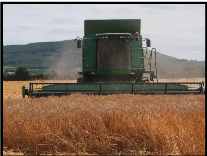
We completed our harvest of our Winter Barely in late July, once all the rain had stopped!