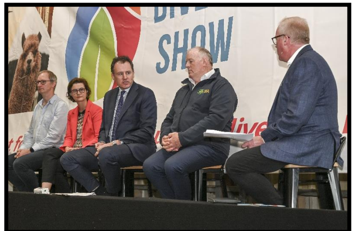
High profile names on this year's keynote panel at the Energy and Farm Diversification show!