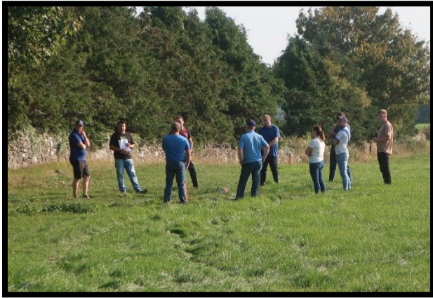
(Below) A fantastic turn out at the show this year- always wonderful to see!