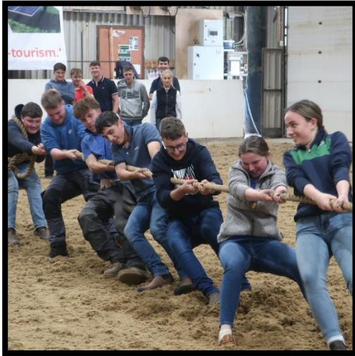
Level 5 Agriculture students getting to know each other through some friendly tug-o-war contests!