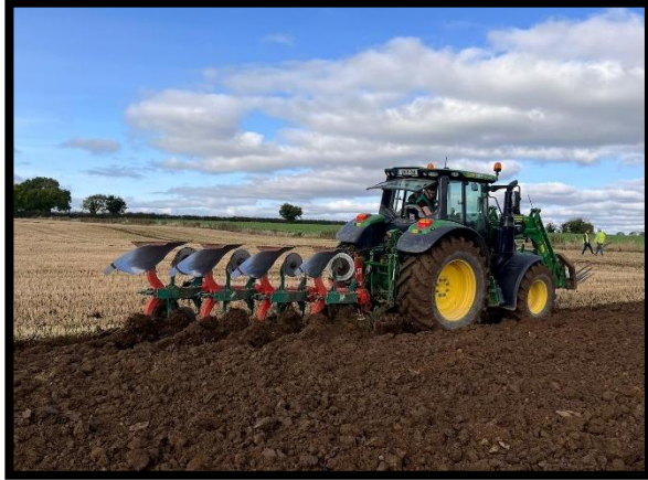
Students getting stuck in and assisting with ploughing.