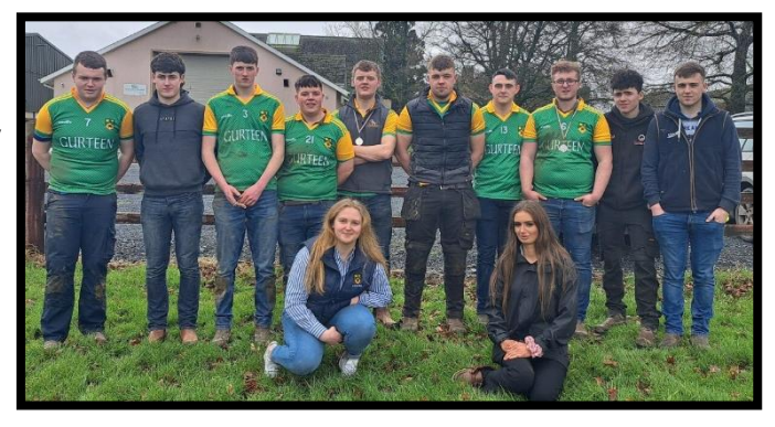
This year's team who represented Gurteen at the Inter-College's day at Kildalton College