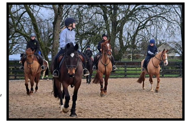
Students enjoying some outdoors riding before their placements began.