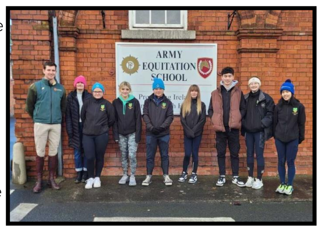
Outside the Army Equitation School for one of their fantastic trips.