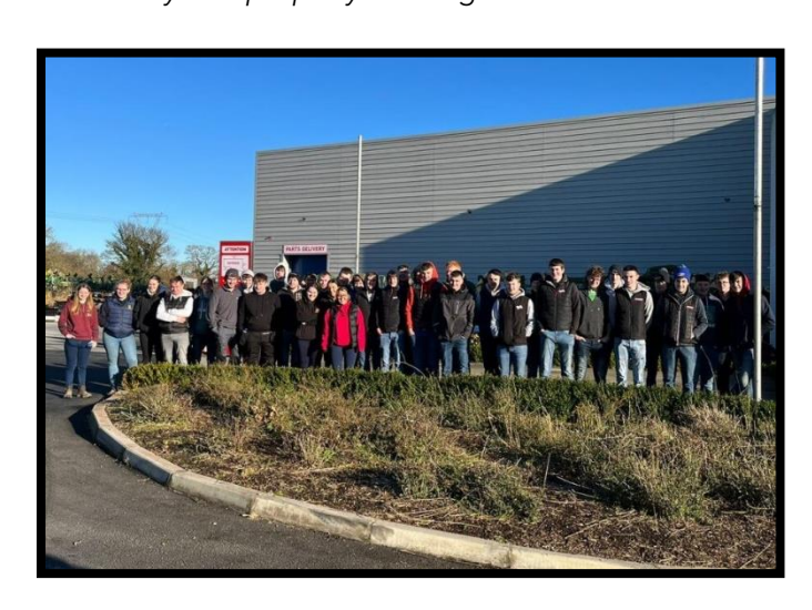
CASASC AGRICULTURE AND FOOD DEVELOPMENT AUTHORITY