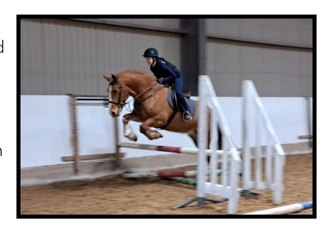
Showing off their indoor jumping skills!