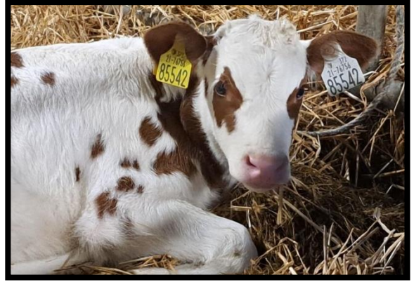
The farm is abuzz with new life, like this lovely dairy calf!