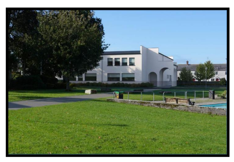
Proposed new view from the pool!