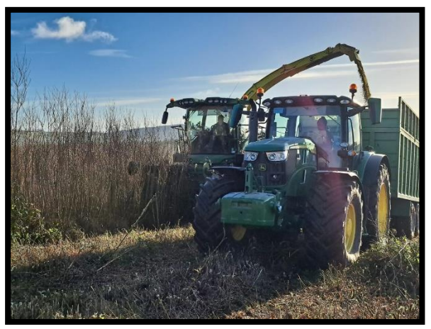
In January we harvested our willow, which will now be dried before it's use in heating up the college.