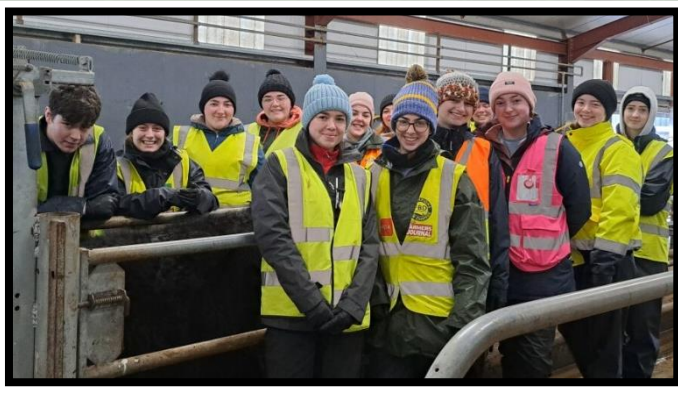
Some of this year's TUS Athlone Veterinary Nursing students at Gurteen!