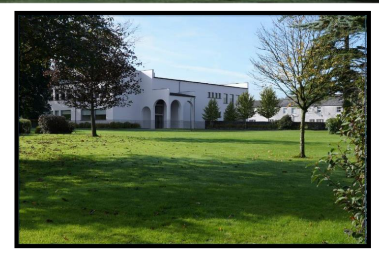
New view, once the classroom block is built!