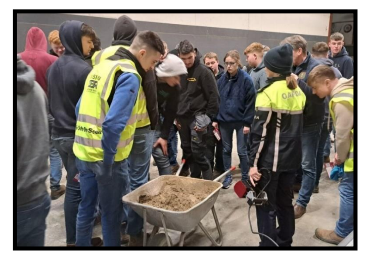
Gardaí talking to students about farm vehicle safety and property marking to deter theft.

We are almost halfway through the academic year. As we enter the Spring season, there is a definite sense of a change in the air. The birds are starting to sing a little louder, the days are getting a little longer and students on our full-time courses are beginning to see the end in sight. In the halls, you can hear the excitement building as they anticipate what work placement will be like. This change in pace can also be sensed by teachers who are anticipating the opportunity to catch up on tasks that were left aside while they put all their efforts into giving the students the best possible learning experience during the Autumn term.