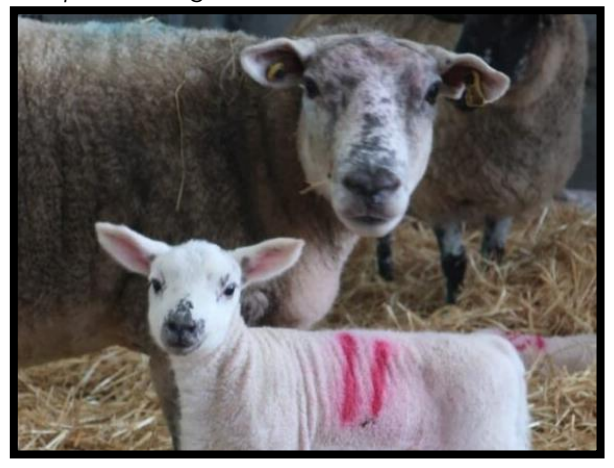
Lambing is well underway! In January we had 109 lambs from 75 ewes.