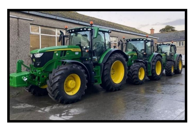
Our brand-new fleet of '24 plate tractors which were delivered in January