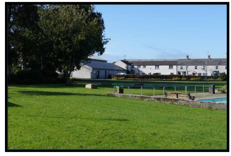
Current view from the pool

The building will include 6 purpose-built classrooms with enough space to accommodate 200 students. It will ensure future students at Gurteen College are taught theory in classrooms that match the high quality of the practical teaching workshops and yard.