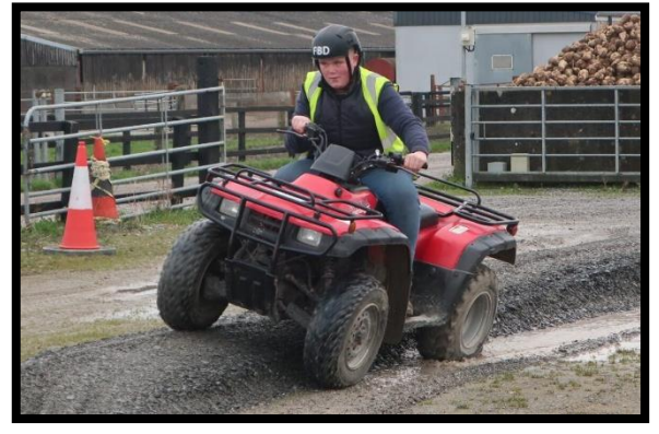
Students busy practicing their ATV skills before they headed out on placement.