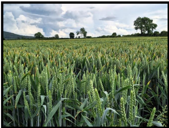
Winter Wheat growing well after recovering from pesky crows!