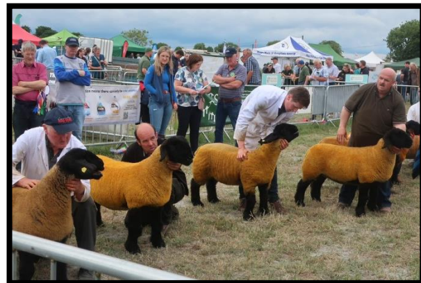
Some of the spectacular sheep on display and competing at this year's SHEEP 2023 show!