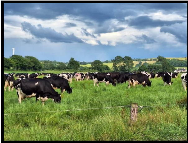
Dairy cows out grazing after a busy calving period!