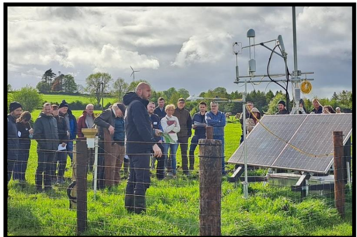
Attendees at the Teagasc workshop on Grassland Peat Agriculture listening to a talk on the Eddy Covariance Flux Tower.

A superb day of making new connections and strengthening our appreciation of how lucky we are to have such a vast diversity of soils here on our farm.