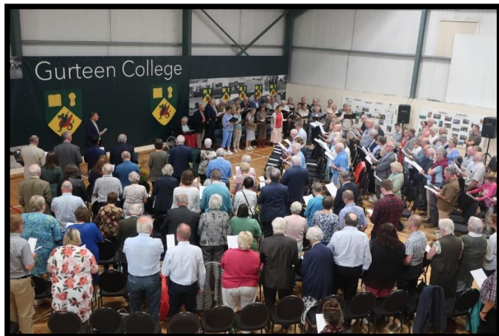
A spectacular turnout to the ecumenical service honouring 75 years of Gurteen- a wonderful chance to reminisce and celebrate our history.