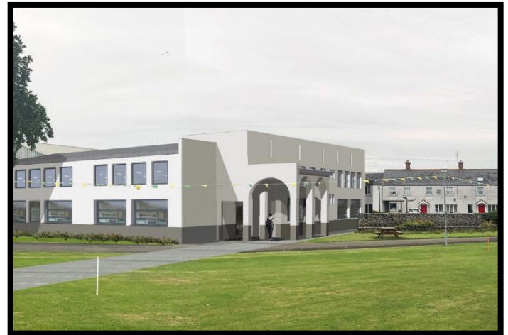
3D render of the proposed new teaching block.

Keep your eyes peeled for future updates on this exciting plan! We can't wait to hopefully start building soon.