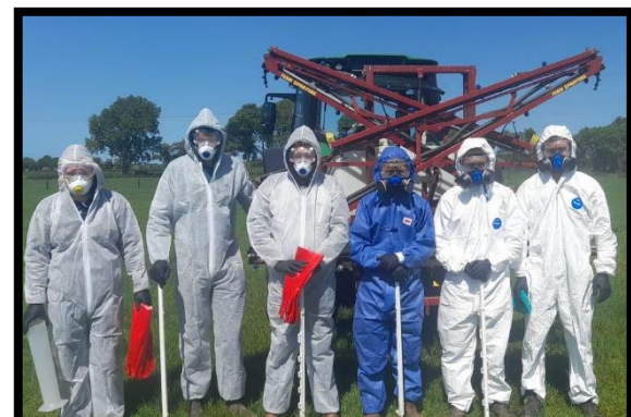
Level 6 students completing a sprayer course gaining valuable hands-on experience!