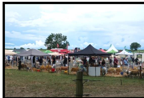
A fantastic turn out for Sheep 2023, with people from across Ireland coming together for all thing's sheep!

A huge thank you to everyone who helped make the event as successful as it was- and we hope you guys had as much fun as we did!