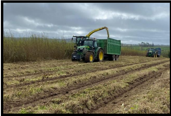
Photo from a successful willow harvest back in March.