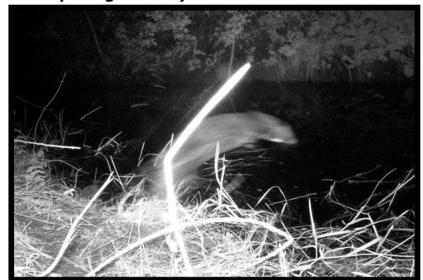
A shot of the elusive otter which has been spotted on our farm.

Want more frequent updates? Follow us on all our social media pages!