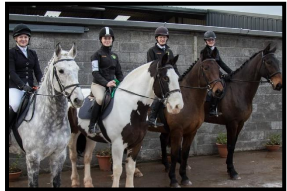
Equine Courses return to Gurteen! We're super excited to have them back- and hope you are too!

We're looking for horses which are over 14.2HH and between 5-15 years old. These horses need to be jumping at least 90cms to 1m, and be capable of doing a dressage test at prelim/novice level, plus have some cross-country experience. If you think that you have a horse which may be suitable, please email a description of your horse, including it's age, experience and temperament along with some photos/videos to Stephanie Scully at sscully@gurteencollege.ie . If you want some more info, feel free to give us a call, we'd love to chat!