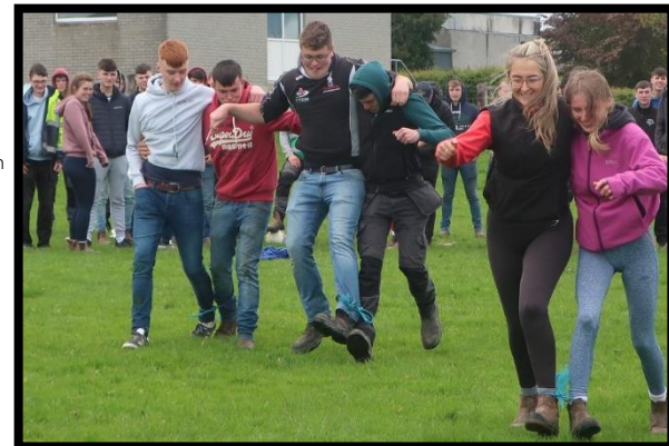
This year's Level 5 PPD events included such antics as three-legged races, tug-o-war, wellie throwing, and pool contests!